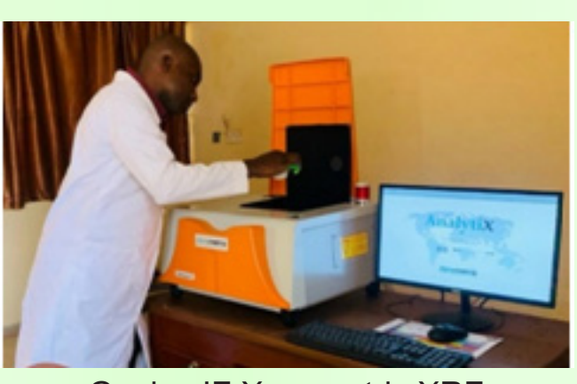
Genius IF Xenemetrix XRF Equipment