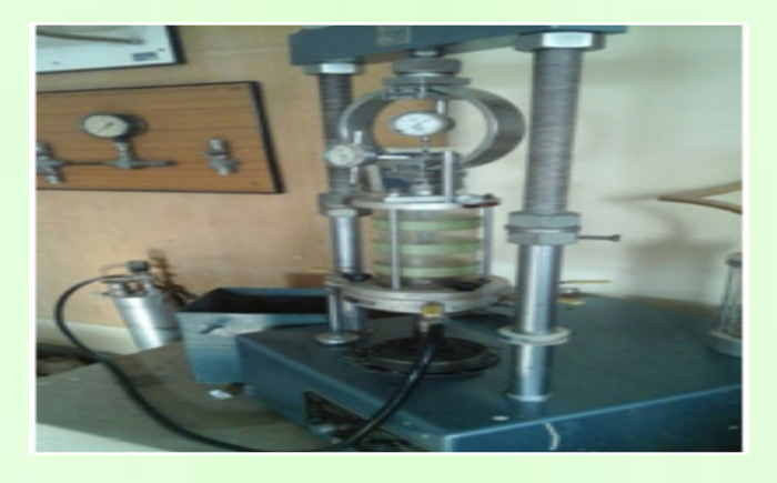
California Bearing Ratio (CBR) Test